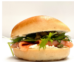
SMOKED SALMON BAGEL