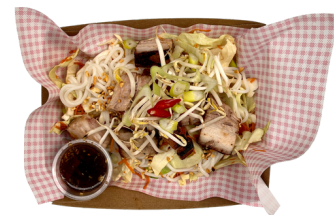
PORK BELLY NOODLE SALAD