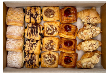
SWEET DANISH BOX