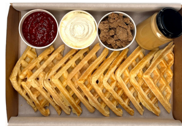
DIY WAFFLES BOX