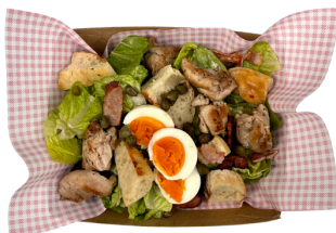
CHUNKY CAESAR SALAD