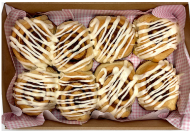
EPIC CINNAMON SCROLLS