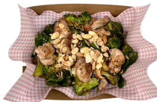
BROCCOLI FREEKEH SALAD