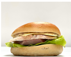
CHAMPAGNE HAM BAGEL