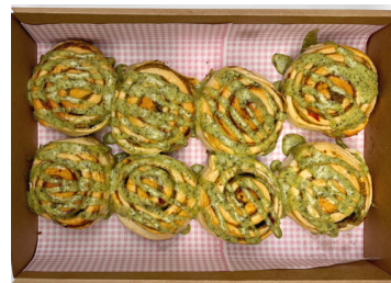
EPIC BASIL PESTO SCROLLS