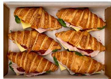
FRESH FILLED CROISSANTS