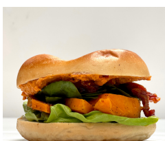
SUMAC PUMPKIN BAGEL